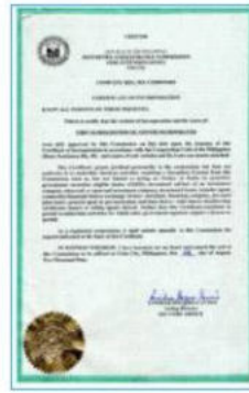
Philippine SEC Certification