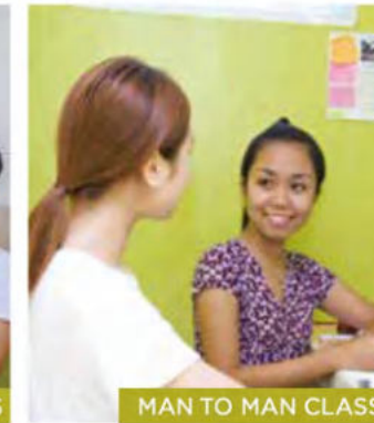
MAN TO MAN CLASS