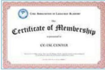
Member of the Cebu Language Institute Association.