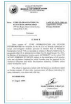
Philippine Immigration Service SSP