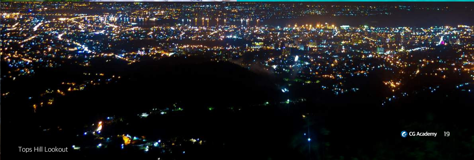
Tops Hill Lookout