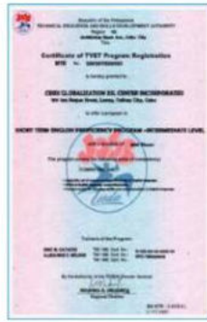
Ministry of Education TESDA